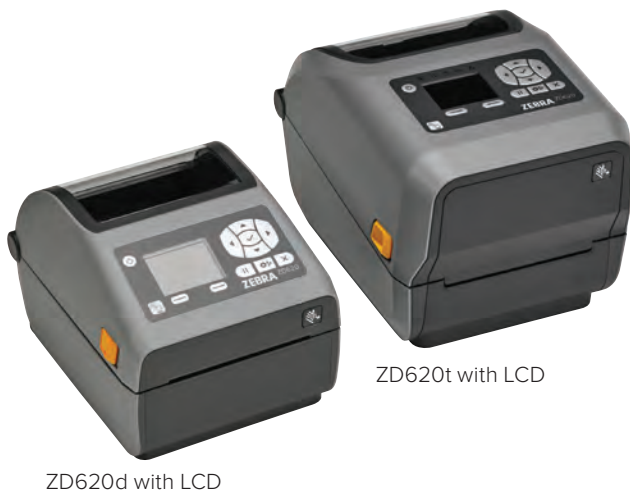
ZD620d with LCD

When print quality, productivity, application flexibility and management simplicity matter, the Zebra ZD620 delivers. As the next generation in Zebra's desktop printer line, the ZD620 replaces Zebra's popular GX Series and ZD500 printers, rising above conventional desktop printers with premium print quality and state of the art features. Available in both direct thermal and thermal transfer models, as well as healthcare-specific models, the ZD620 meets a wide variety of application requirements. It offers the most standard features of any Zebra desktop printer, including an optional 10-button user interface with a color LCD that takes all the guesswork out of printer setup and status. The ZD620 runs Link-OS® and is supported by our powerful Print DNA suite of applications, utilities and developer tools that deliver a superior printing experience through better performance, simplified remote manageability and easier integration. The Zebra ZD620 — delivering the print speed, print quality and printer manageability you need to keep your operations moving forward.