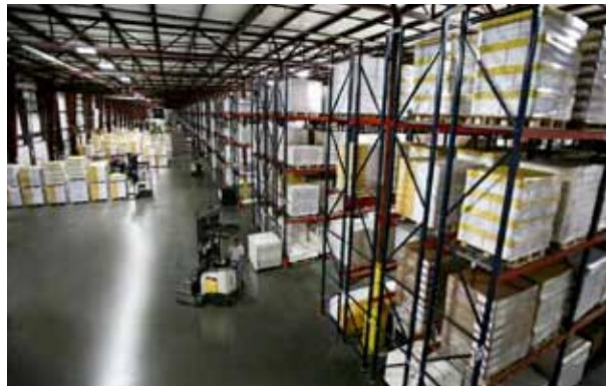
WOW's ever-changing warehouses with solid steel racks is filled with millions of pounds of cheese and paper created untenable RF issues.

WOW material handlers, forklift drivers, and truck loaders depend on Wi-Fi to make their warehouse processes more efficient by gaining universal access to real-time inventory information and eliminating counting and picking errors. The devices are used for a variety of purposes such as scanning pallet and product locations, clocking hours, tracking product movements, tow motor inspection, trailer inspections, driver signatures, calendar entries, and MSDS tracking.