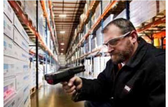
WOW needed a stronger Wi-Fi network that could deliver better service to 98 Wi-Fi-enabled Motorola bar code scanners and 40 badges used for inventory management.

WOW settled on four vendors to bid on the project: Motorola, Cisco, Aruba, and Ruckus Wireless.